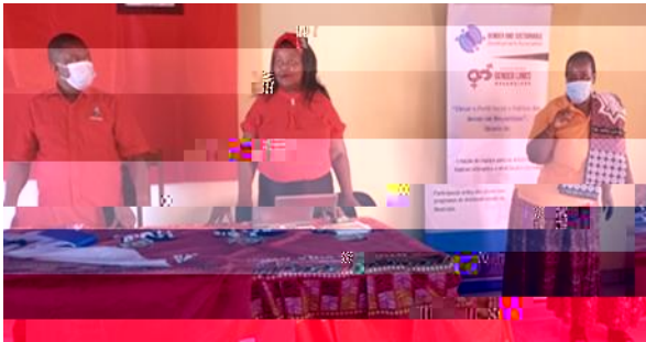
Figure 3: Training module about political parties