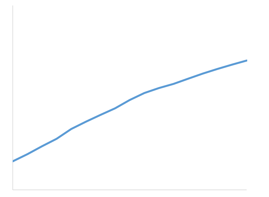
Ratio Male/Female, Age 229