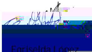
Egriselda López Ambassador

89TJETQ.0000092 1 0 0 0 0 0 1 0 0 1 70.94 482.9 Tr