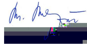
Michal Mlynár Ambassador

Permanent Representative of El Salvador to the United Nations