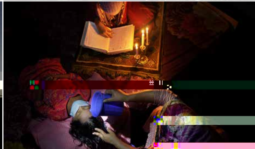
Photo top left Ethiopia Photo bottom left Ethiopia Photo top right Myanmar Photo bottom right Myanmar

In addition to the specific country engagements described above, the