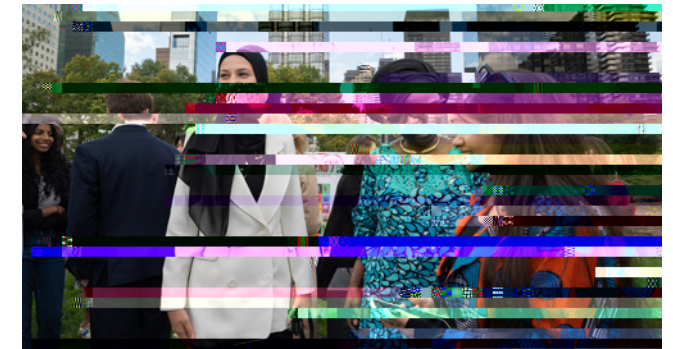
Participants at the Commemoration of the International Day for the Eradication of Poverty, celebrated on 17 October 2023.