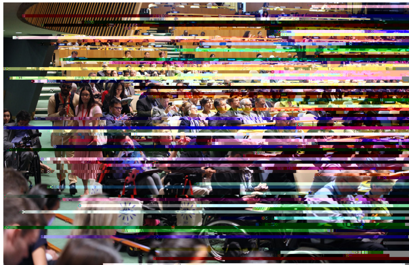
Delegates at COSP17.

a pivotal role in ensuring meaningful participation of disability experts from traditionally marginalized groups in the 17th Conference of States Parties to the Convention of the Rights of Persons with Disabilities (COSP17). By consulting with representatives from organizations of Indigenous women with disabilities, deaf persons, and those with deaf blindness on key decisions, UN DESA fostered an inclusive and diverse Conference. This led to record social media engagement, raising awareness and fostering dialogue on disability rights. The Department's major UN Disability and Development Report 2024 , produced through collaboration with more than 200 experts including representative organizations of persons with disabilities, also provides a robust and up-to-date analytical basis for disability-inclusive implementation of the SDGs globally.